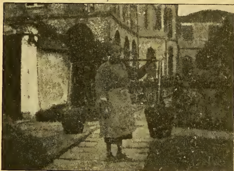
HELPERS AT PONASANG

The boat family consists of the father, mother and five children, from twelve years down to a baby who cannot walk. While the breeze takes the